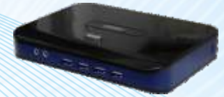
Smart Zero Client