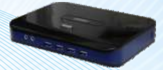
Smart Zero Client