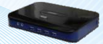
Smart Zero Client