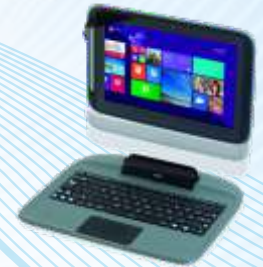
Smart E-Satchel S-01

Today's students live online completing homework assignments, doing research, and socializing with classmates. All the advantages of digital life also come with increasing security risks. McAfee AntiVirus Plus enforces safe and secure computing practices by proactively protecting devices from exposure to malware.